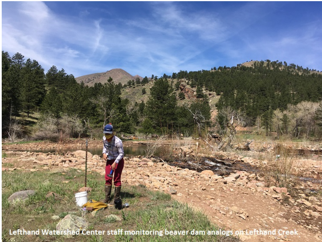
Lefthand Watershed Center staff monitoring beaver dam analogs on Lefthand Creek